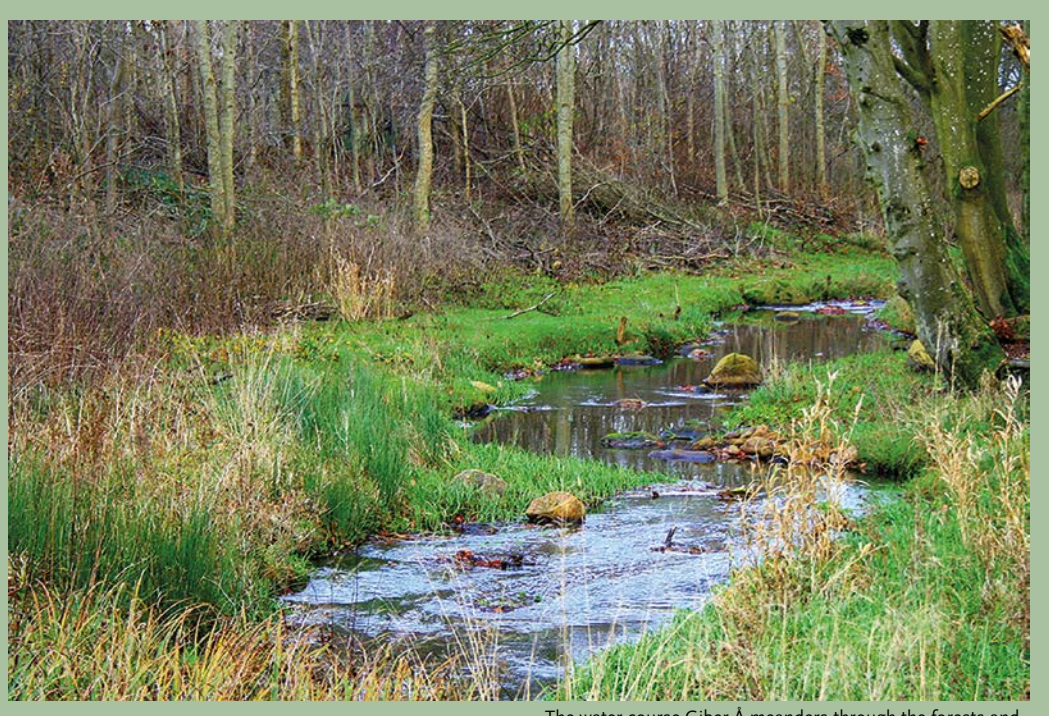
The water course Giber Å meanders through the forests and is a breeding ground for exciting stream insects and sea trout

In 2018, the state of nature in the municipally-owned, nature-protected areas was assessed as improving, while the overall state of nature in the municipality was unchanged compared to 2011.