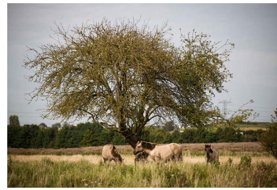
Rewilding in the 140-hectare area of nature, Geding-Kasted Marshland. With the help of grazing animals, we want to achieve 'self-management' and more dynamic and wild nature.

Every year, Aarhus Municipality enters into new agreements on nature conservation of existing natural areas. We allocate areas for forest and nature via land distribution and purchase of land or operating rights. However, there is a need for even more nature restoration and nature conservation if the ambitions for species-rich nature are to be fulfilled. At Geding-Kasted Marshland, we have chosen to solve this through "Rewilding", where water buffalo, wild horses and wild cattle 'manage' the natural areas all year round. It takes place in large, connected natural areas that largely manage themselves, and where e.g. winter wet areas attract migratory birds, while the nightingale sings in the willow thickets of the bog.