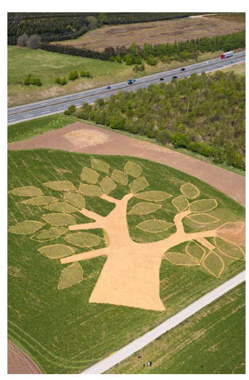
The new forest at Ølsted is quite a rare sight, especially seen from the air, where it becomes visible that the forest is shaped like a giant tree with a trunk, branches and 30 petals. The 3,000 trees must help to secure the groundwater resources in the area between Søften and Lisbjerg, must contribute with more recreational nature to the local area and, of course, to carbon capture and storage. The forest was planted in close collaboration between Aarhus Municipality, AutoMester E+ and the national organization 'Plant a Tree' (Plant et Træ).

The experience of the forests close to the City gives the impression that Aarhus Municipality has plenty of forests, but in fact we are below the national average. New forest areas protect the groundwater and at the same time provide recreational opportunities for citizens in urban development areas and in forest-deprived parts of the Municipality. Therefore, Aarhus Municipality want to plant more forest with native species and manage it more extensively. Over time, the forests will become habitat for a large number of species and thus increase biodiversity.