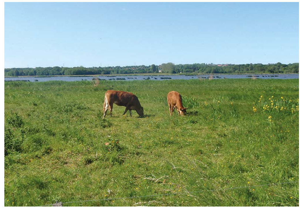
Safeguarding the biological diversity in Aarhus Municipality is done, among other things, by the care and restoration of small and large natural areas in the open country. Nature preservation keeps the grass down so that more flowering species can grow in the area and the biodiversity increases. The picture shows an area by Brabrand Lake.

Biodiversity is declining sharply throughout the world, and in Denmark, even previously common Danish species are becoming fewer, and many species are in danger of disappearing altogether. Therefore, Aarhus Municipality has a major and important role to play, by taking care of our nature and turning the decline in biodiversity into progress by halting the loss of habitats for wild animals, plants and other organisms.