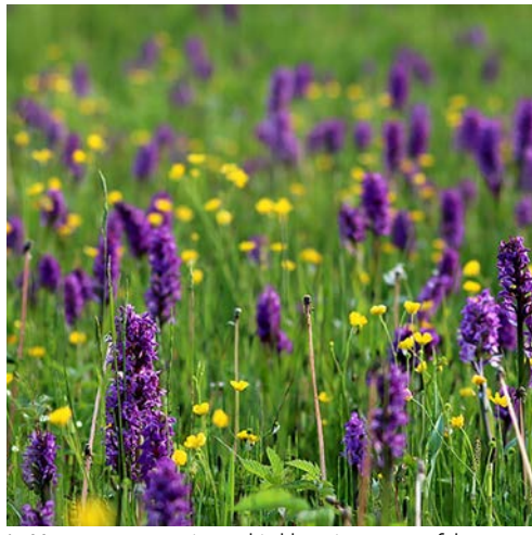
In May, you can experience this blooming carpet of the protected orchid May Cuckoo and Low Ranunculus in a meadow east of Lisbierg Forest.

At the same time, we must create more space for nature and ensure better wildlife crossings between existing natural areas. We can do this by taking the lead as a municipality on our own land, prioritizing it in our planning for private land and entering into collaborations and agreements with private landowners.