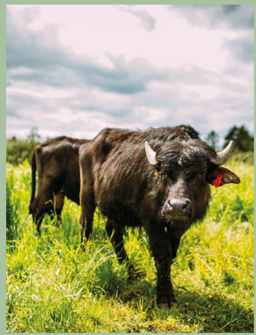
Water buffalo form part of the Rewilding project in Geding-Kasted Marshland with large, connected areas of nature.

The municipally-owned areas constitute approx. 25 % of the areas.