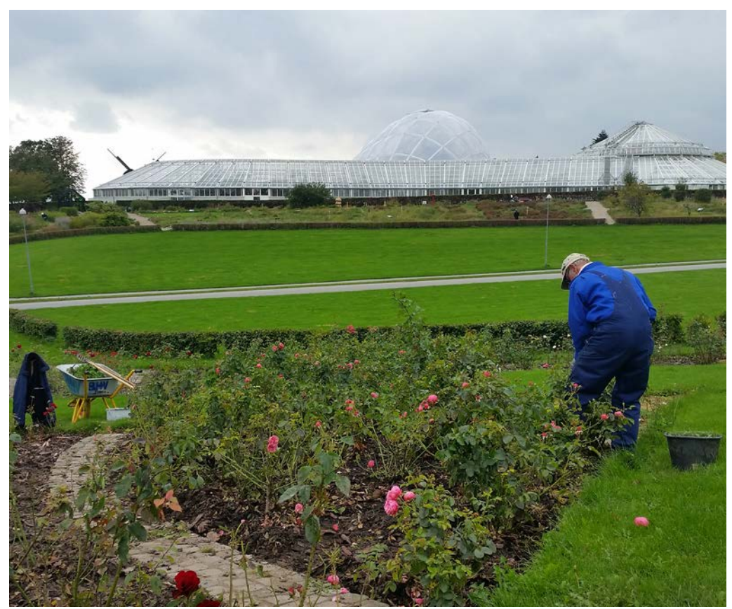
The association 'Friends of the Botanical Garden' look after the rose garden, the theme gardens, the acid soil beds and the perennial garden in the Botanical Garden. Communal weeding days and social gatherings are key words for the association.