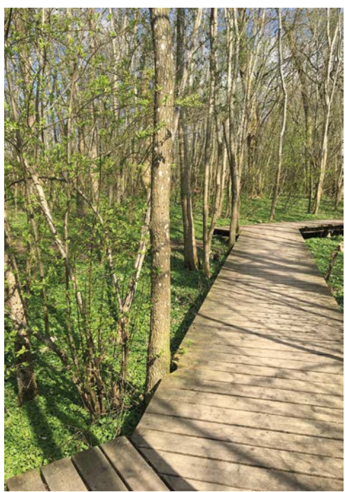
An experience route at Skjodhøjkilen that offers the opportunity for a sensory experience. The route can also be used by wheelchair and walker users.

Good accessibility, also for wheelchair and walker users, is crucial for people to be able to experience and use nature in the best way. Accessibility is also about feeling welcome in nature and the green areas. Both roads, paths and, not least, good information must ensure that as many people as possible can benefit from the many possibilities.