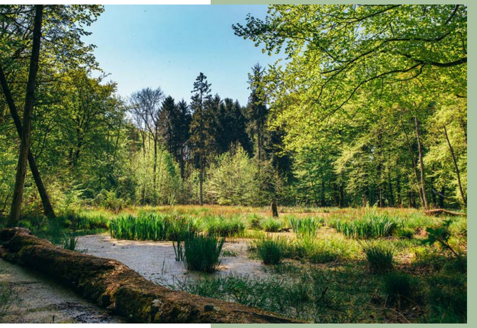
Water in the forest floor between the tall trees helps to provide more varied nature. Here it is in Lisbjerg Forest, which is a mixture of old and young forest.

Biodiversity is highly valued in the municipal forests, while recreational use is important for both the residents of Aarhus and the visitors to the City. This places great demands on a dynamic management that can ensure the balance between use and protection of the forests' natural values.