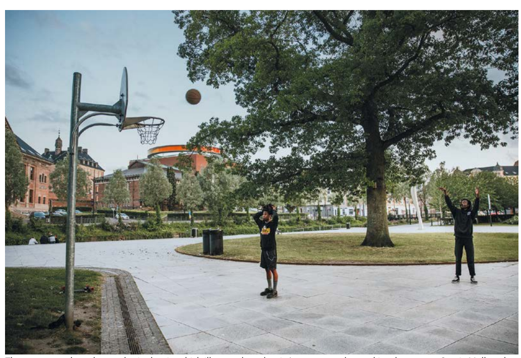
There are several good examples in the city which illustrate how the city's spaces can be used in a better way. One is Mølleparken, which is used by different groups of citizens at different times of the day; people hang out on the grass while others play table tennis, basketball or chess.