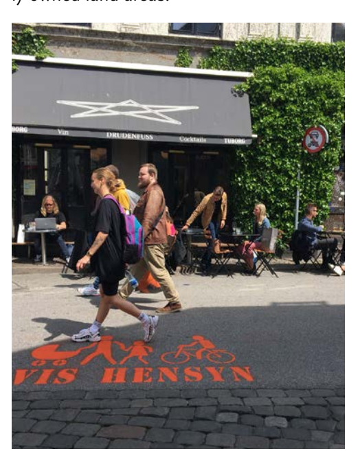
Green elements can also be incorporated and create atmosphere in places where there was no greenery originally.

As we become more inhabitants, the strain on the natural areas and the existing parks increases. Therefore, there is focus on ensuring that there is room for greenery as the city grows. It is all about increasing the quality and proportion of greenery in the public areas by securing space for new trees, green and inviting edge zones as well as green roofs and facades. And it is all about securing more good and well-designed green areas with more species diversity in connection with the urban development of both publicly- and privately-owned land areas.