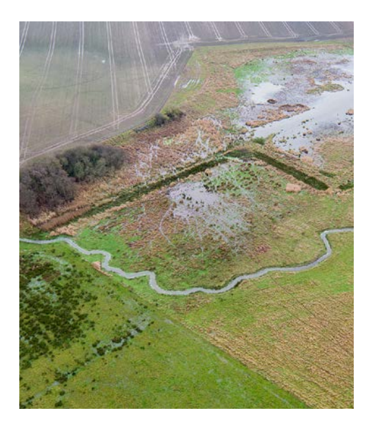
The natural hydrology has been recreated in the river valley along Kapelbæk near Langballe and Beder. Now, the former distributed stream is once again meandering through the terrain.

In the open country, Aarhus Municipality contains a varied natural environment, with river valleys, hills and a long, wild coastline influenced by waves. But nature is under pressure. To stop the decline in biological diversity and to create more and better habitats and better possibilities of plant dispersal and wildlife crossings, there is a need to preserve the existing nature.