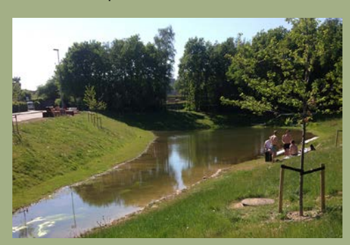
A rainwater reservoir in Risvangen with recreational possibilities. The water is retained when it rains heavily.