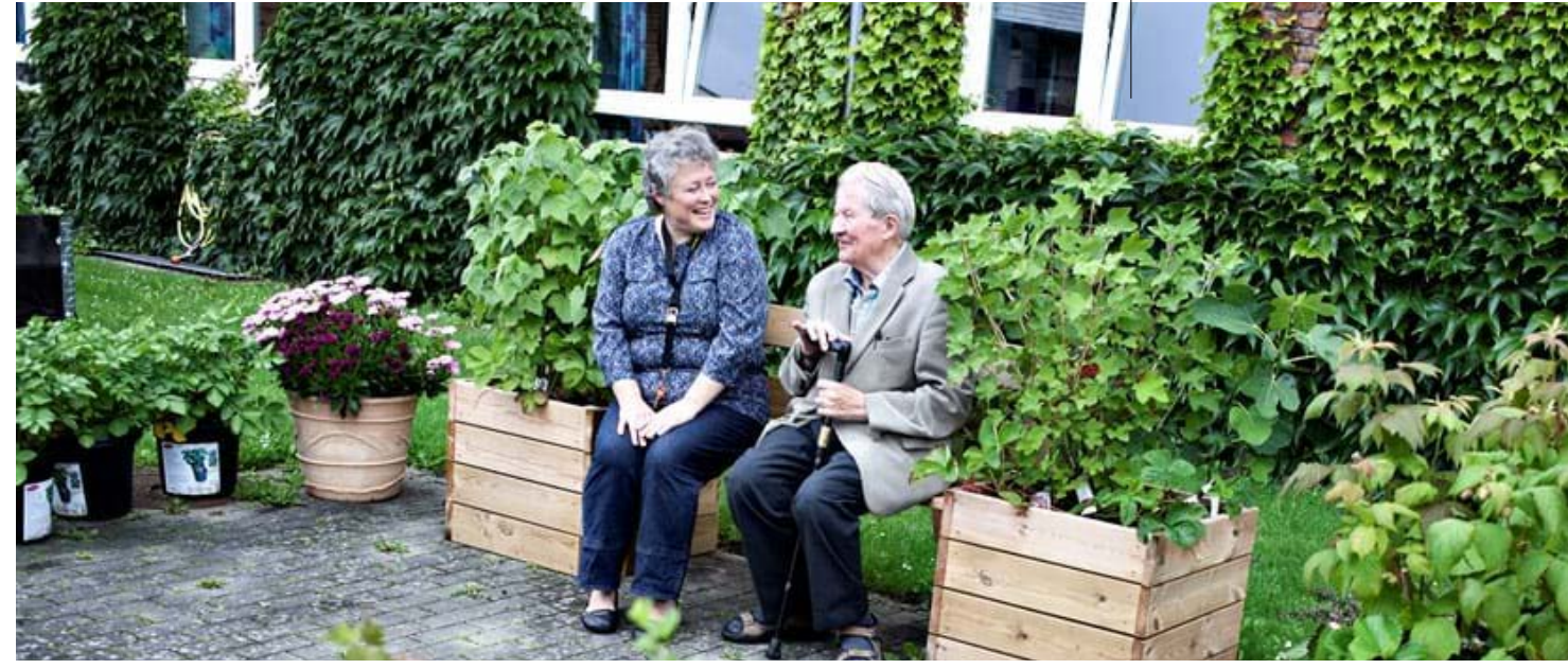
There are also great qualities in the small and "quiet" urban spaces with green walls, where people can sit down, breathe and experience a quiet moment.