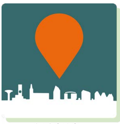
App: Opdag Aarhus

Aarhus Municipality wants to make it easy for Aarhusians of all ages to understand and to engage with the nature that surrounds us. Knowledge and familiarity are keywords in this connection, and therefore communication about nature plays a key role. Many different media and platforms are already in use, and work must continue with both physical, digital and human communication about nature. Physical signage and information boards enable the Aarhusians to understand the specific type of nature they are standing in the middle of. Map materials and other media can be used both before, during and after experiences in nature, so that not only are they inspired to new experiences, but space is also created for immersion in our nature. The "Discover Aarhus" app is one of the media that specifically provides the opportunity to plan new trips and routes and at the same time immerse yourself in information about the nature you are exploring.