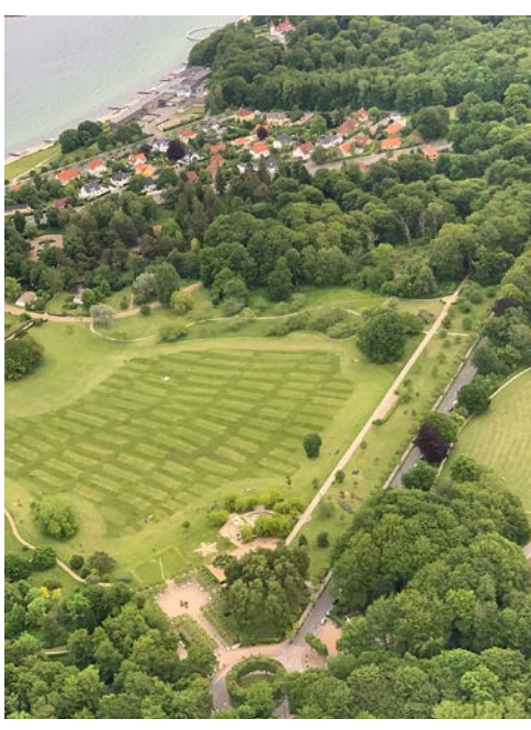
The Memorial Park is a visible result of the Department of Technical Services and Environment's work to make the city's life function under special circumstances such as during the corona era.

In the city centre, the parks play a very special role and are of great importance to the life of the city. The parks can be used by everyone across generations, for recreational activities, sports and cultural events. Also, the parks and the large green areas along the coastline and the river are absolutely crucial for the presence of urban nature and biodiversity in the city.