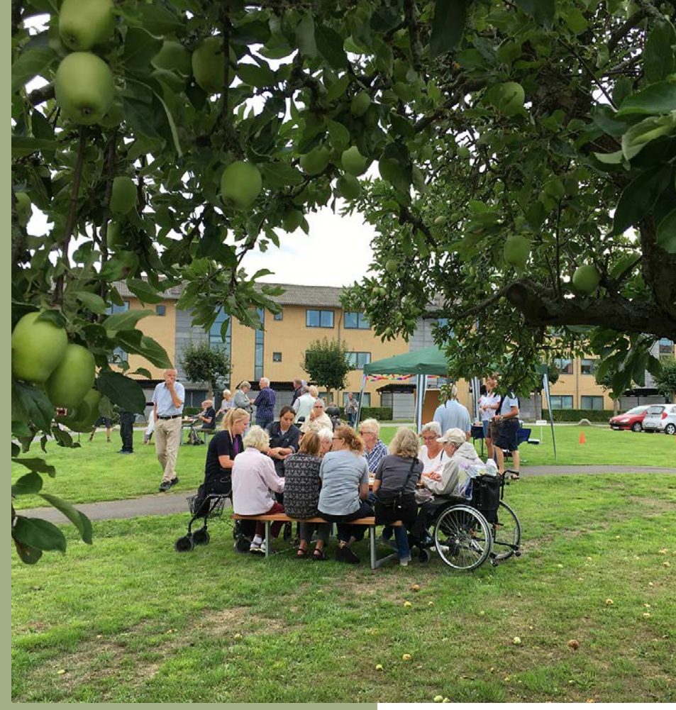
A green area in Vejlby, where nursing home residents enjoy a get-together in the apple grove.